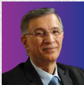
DR. NIRANJAN HIRANANDANI CHAIRMAN EMERITES – NAREDCO NATIONAL FOUNDER & MD – HIRANANDANI GROUP